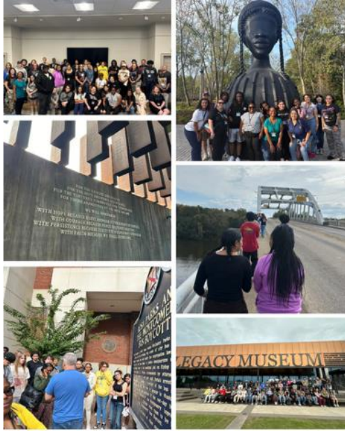
Academy students and educators were able to explore firsthand, through visits to historical landmarks, how and why the Civil Rights movement happened.

Students were empowered on the 2024 Civil Rights Journey (CRJ) as they explored America's history and the fight for Civil Rights. Traveling just before the U.S. Presidential Election, students reflected on the relevance of history to current events. Several students who had just turned 18 committed to voting if they had not already. During this four-day experiential trip using history and current issues as a launching pad, students and educators visited multiple museums and historical sites displaying artifacts including life-sized sculptures, powerful exhibits, and preserved dwellings of enslaved people.