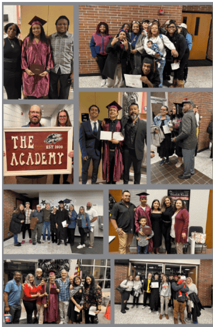
SYA winter graduates proudly stand ready to take on their next adventure!

Simon Youth Foundation (SYF) proudly celebrated the success of 288 students who graduated from Simon Youth Academies (SYA) across the country this winter. Ceremonies were held at SYA on Cochran, SYA at Sugarloaf Mills, SYA at Phoenix High School, SYA at Avon, SYA at Hickory Hollow, SYA at Old Cockrill, and SYA at Opry Mills.