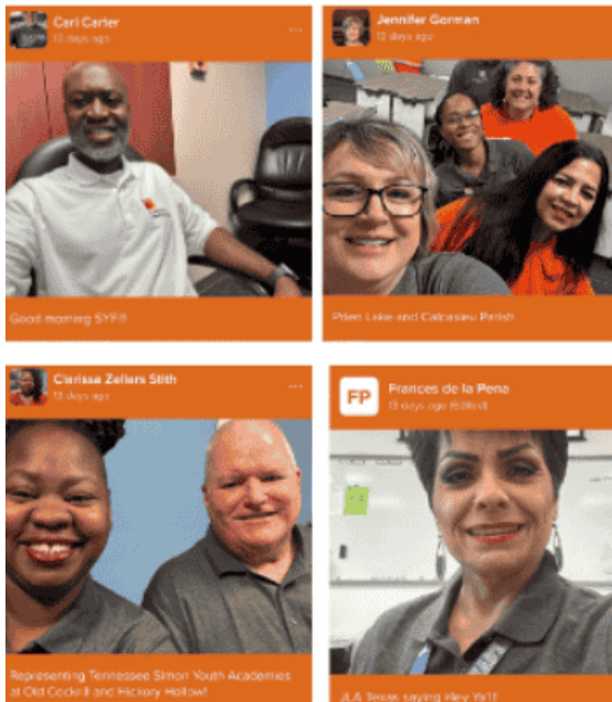
Excited Academy staff participating in the virtual conference.