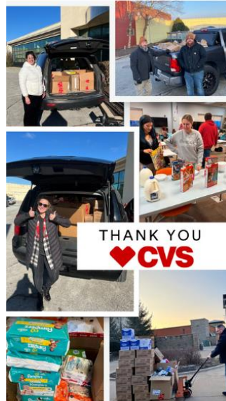
Indiana educators happily picking up items donated by CVS.

SYF wants to recognize CVS for their generous donation of essential supplies to our Indiana academies. From hygiene products and food to school supplies, the contributions are making a meaningful impact on students and teachers. "We are so thankful for CVS' support," said a teacher at one of the Indiana academies. "These donations help alleviate stress for our students, giving them the tools and confidence they need to thrive." Partnerships like this highlight the power of community collaboration to create opportunities for students to succeed. Thank you, CVS, for your dedication to education and for helping us build brighter futures!