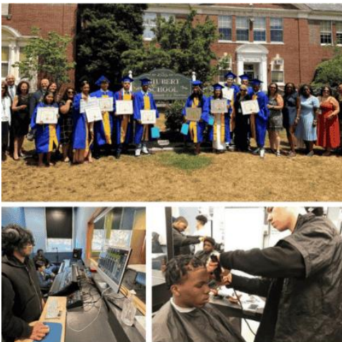
SYA Baldwin students get hands on learning through programs such as recording studio arts and barbering.

The Simon Youth Academy at Baldwin in New York, has been part of the SYF network since 2018. They offer students in grades 9-12 both academic, Career and Technical Education (CTE) credits through programs such as Barbering, Medical Administrative Assisting, Criminal Justice, Recording Studio Arts, and the new Future Jewelers Academy. These are two-year programs in which students acquire the knowledge, skills, and requisite hours required to take licensing exams in their areas of study. The goal is for students to graduate with a NYS Regents diploma with CTE credentials.